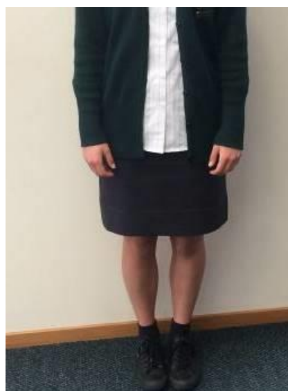
Please note: School knee-length skirt is to be worn at knee length, as illustrated above