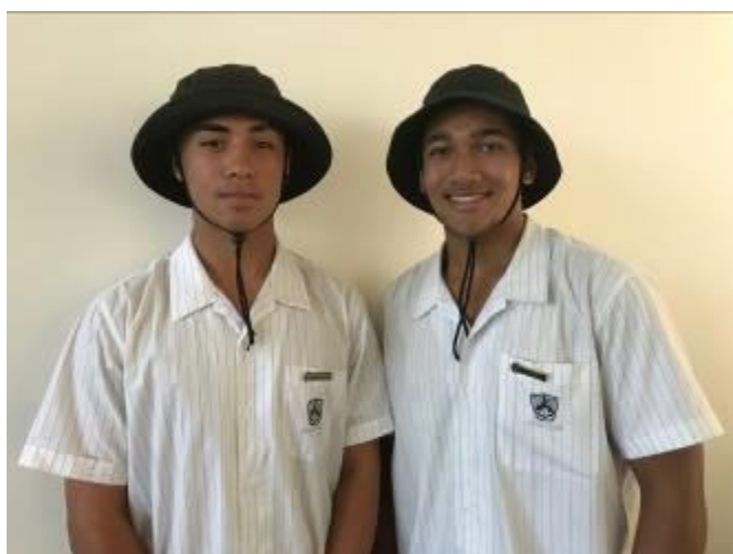
Be Sun Smart! Uniform item available from the College Shop